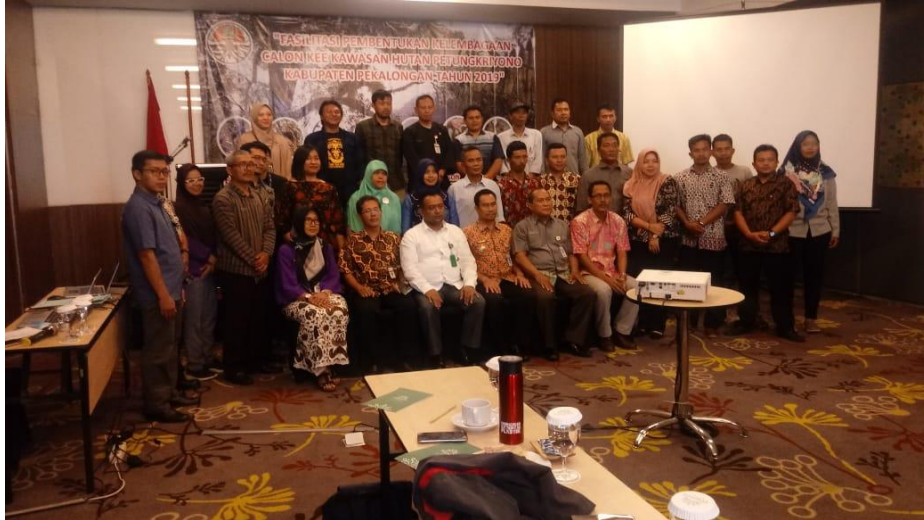
Group photo collaborative forum for Petungkriyono forest management

A collaborative forum for Petungkriyono forest management have been established, based on the latest stakeholder meeting on 14 November 2019 hosted by Forestry Agency of Central Javan Province. We joint as a member of this forum and all agree to propose petungkriyono as Essential Ecosystem Area, a new conservation area form that managed based on collaborative management under Ministry of Forestry Republic of Indonesia . in the forum we proposed an area about 7,6833 Ha for essential ecosystem.