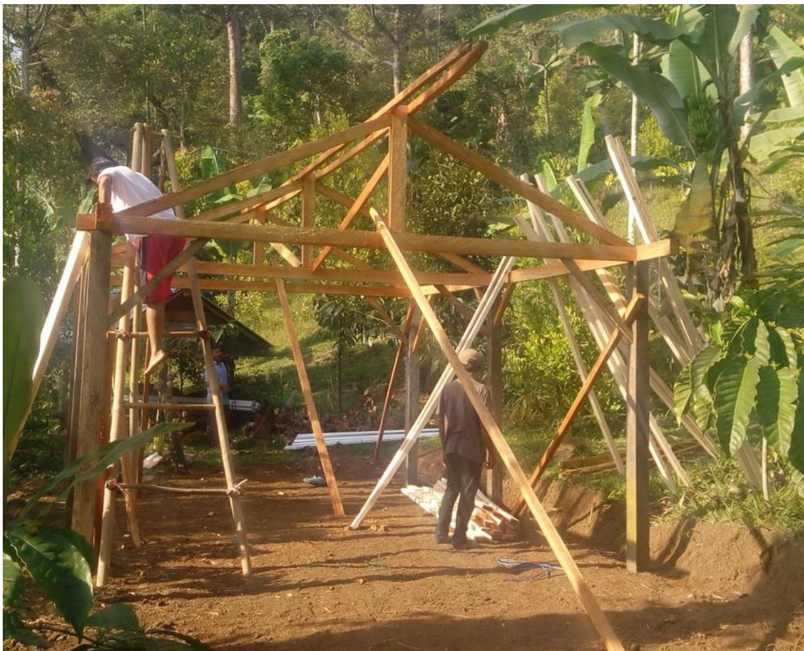
Build a facility for stingless bee collection and propagation in Mendolo village.

Post-harvest coffee training for Mendolo youth people.