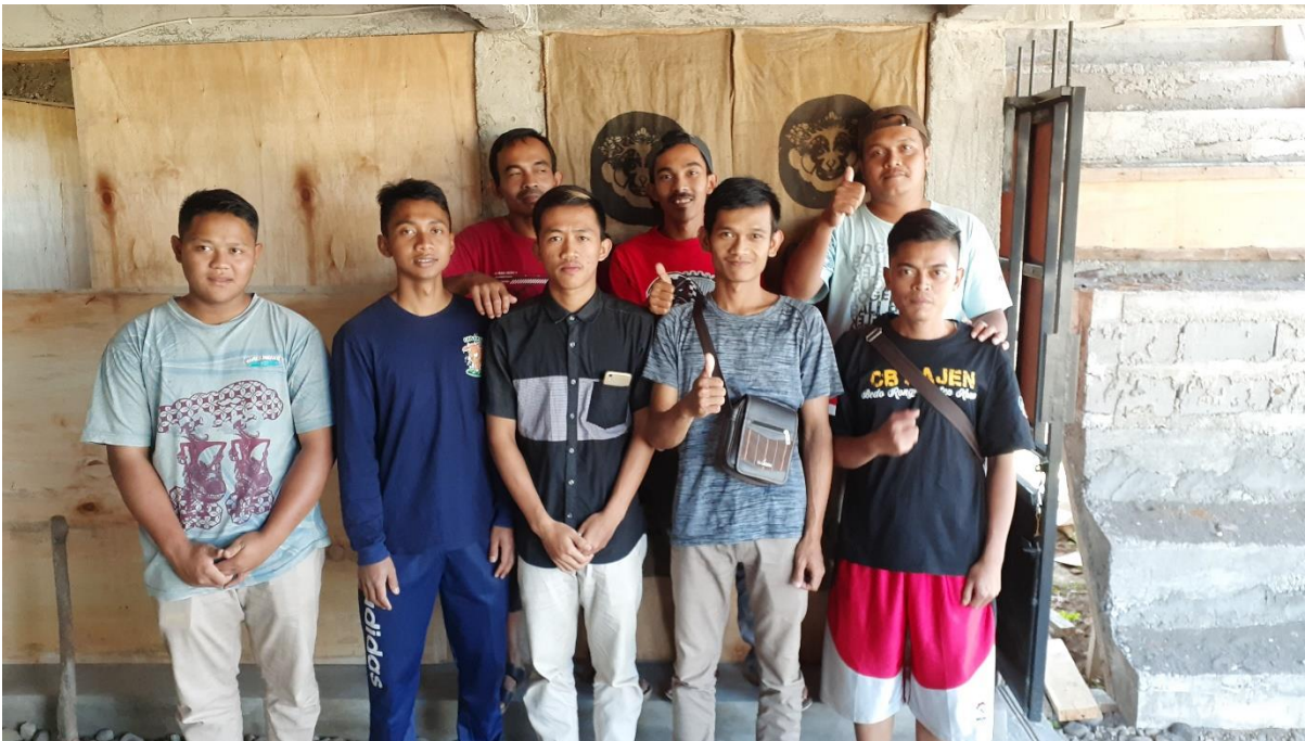
with all coffee training participants

The facility is ready to use now, and organizing farmers have been established also to manage this facilities.