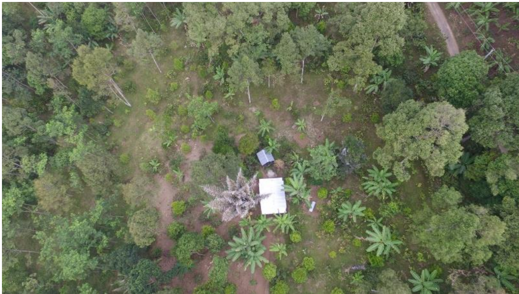
. Aerial view Mendolo agroforest plot