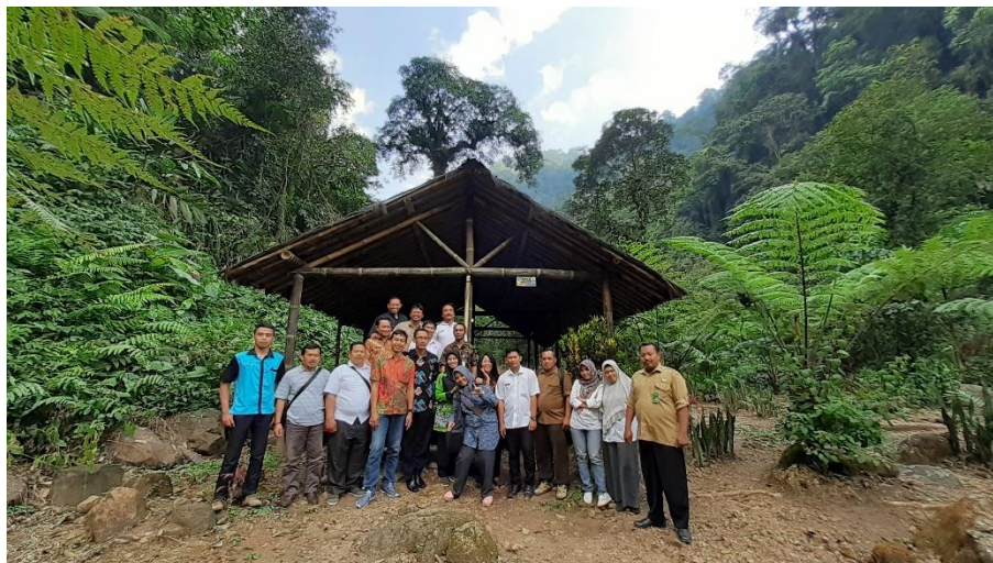
Participants stake holder meeting to initiate collaborative forum

Series of meeting, have been done with local government of Pekalongan regency, the meeting is initiate process to enhance forest protection status for Javan gibbon habitat, especially in the Petungkriyono Regency. First stakeholder meeting was done in 28 June 2019 to start regional forum for relevant stakeholder. In this meeting we present a talk about Javan gibbon and biodiversity important value in Petungkriyono forest. Participants of this meeting are government agencies such as : PERHUTANI, BKSDA, DLHK, CDK Pekalongan, BAPPEDA, Village government, youth organization (POKDARWIS), and NGO.