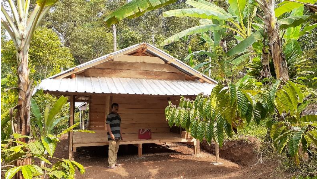
Community building have ready to use

Demonstration plot, have been established and ready to use, a building in the field are ready to use for farmers meeting and group discussion, including field practice. The facilities include beekeeping 20 colonies, room for meeting, and agroforest plants ( durian, coffee, cloves, mangosteen, etc) that already grown in the about 3000 m2 area.