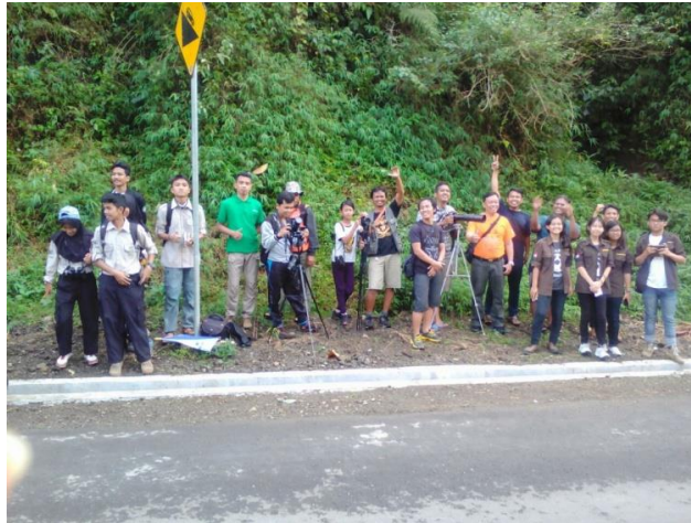
Photo 5. Primate watching in Kramat village

https://swaraowa.blogspot.co.id/2017/11/siregol-primate-watching.html