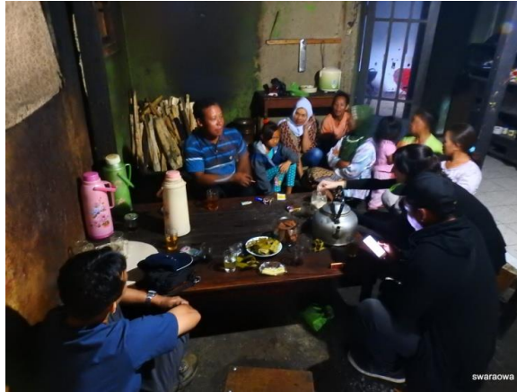
Photo 1. Informal discussion to send the conservation message