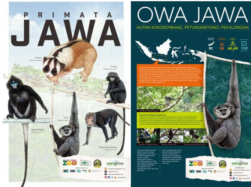
Photo 6 . Infographic on Javan primates and Javan gibbon in Sokokembang