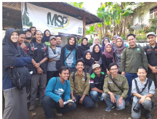
Photo 4. participants Sokokembang primate field course 2017

Read the report here : http://forestation.fkt.ugm.ac.id/index.php/kelompok-pengamat-peneliti-dan-pemerhati-kp3/kp3-primata/