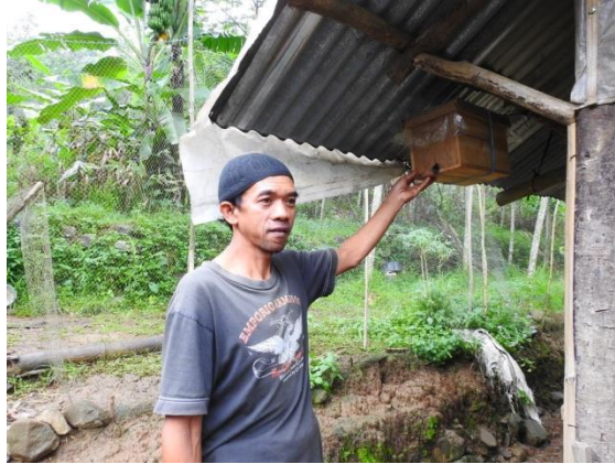
Photo 8. Bee keeper in Sokokembang