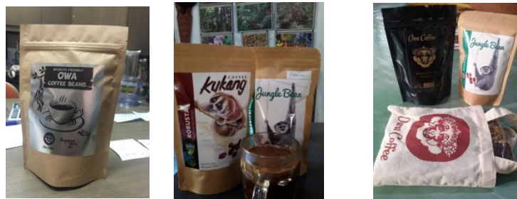
Photo 12. coffe packages for collaborative work