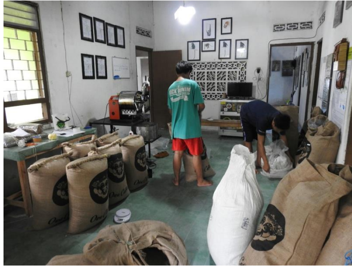
Photo 10. Activities in owa coffee roastery

Kopi owa that produced in Sokokembang for local market, is now developing their own business and maintained by a family where we have been working with. We still assist to prepare the beans quality and packaging. Our coffee house in Yogyakarta is special to prepare the beans to be exported to Singapore zoo. Currently we recruit four people to work in the roaster house, the two people is from Javan gibbon habitat, we prepare them for local professional development, to maintain coffee production sustainably.