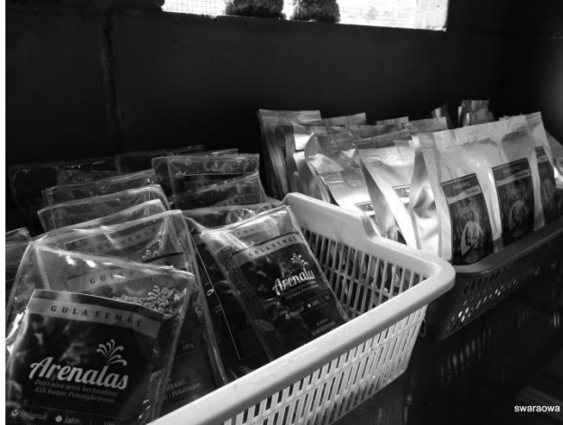
Photo 11. Kopi Owa production in Sokokembang