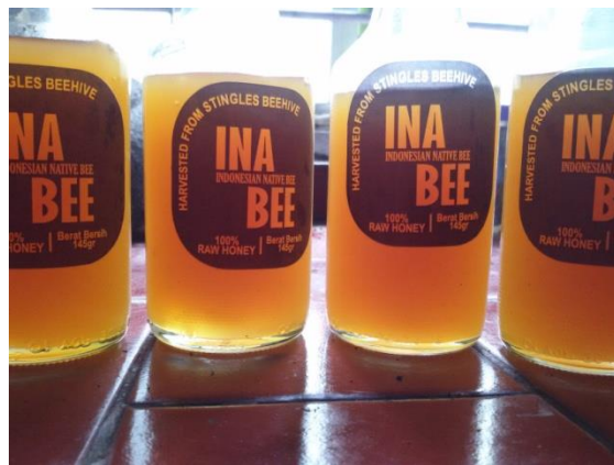
Photo 9. Stingless bee honey packaging