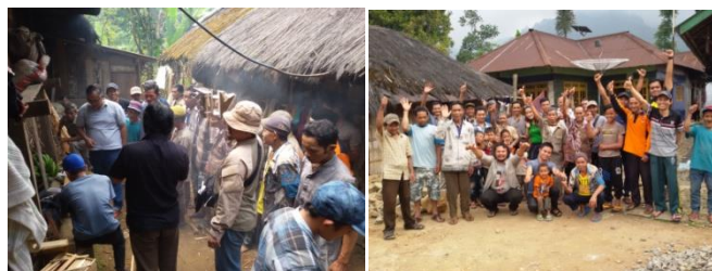
Photo 7. Beekeeping traning participants

https://swaraowa.blogspot.co.id/2017/09/pelatihan-budidaya-lebah-di-habitat-owa.html