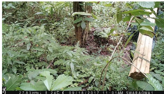
Photo 2. camera trap detect illegal logging in the Javan gibbon habitat