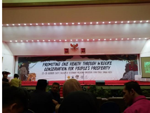
Photo 3. presented at International wildlife symposium in Aceh